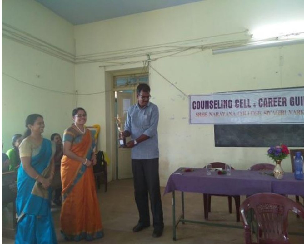
MOMENTO HAND OVER