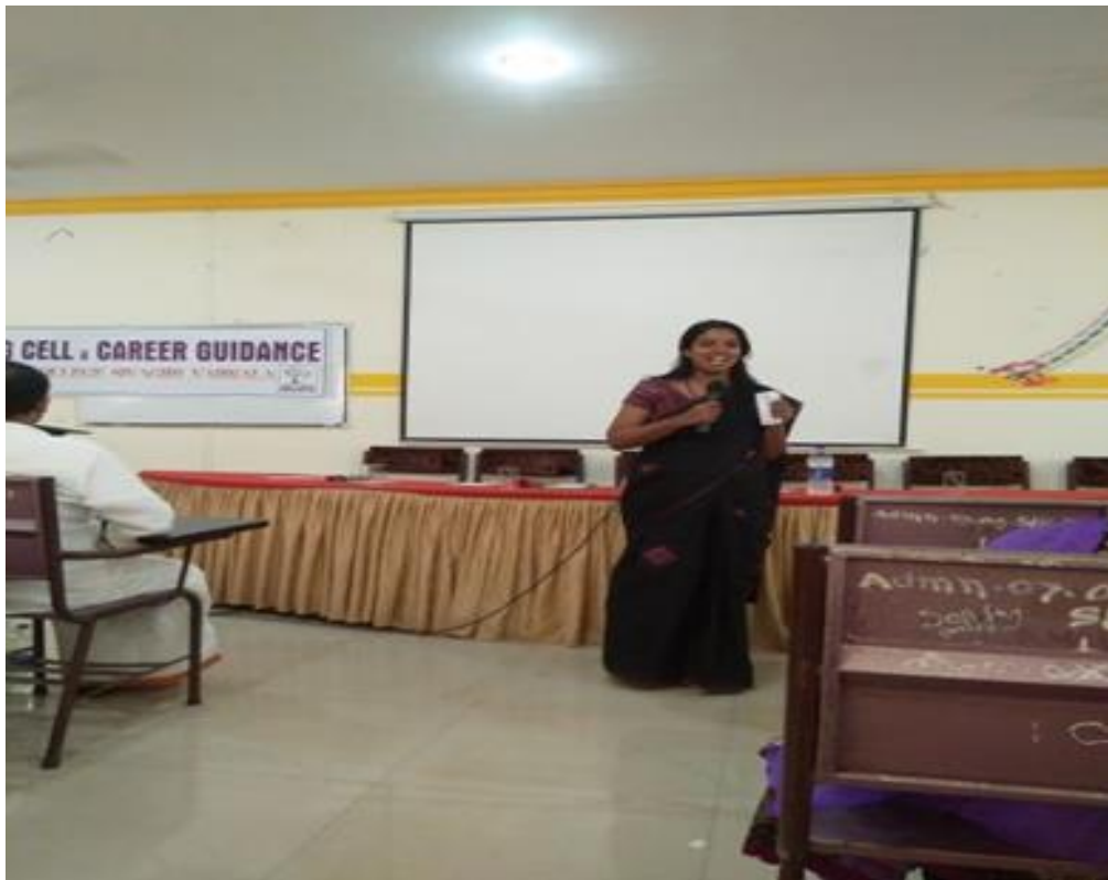
STRESS MANAGEMENT CLASS